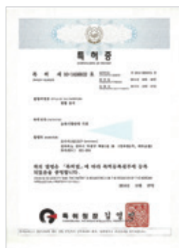
Patent registration on self-heating containers