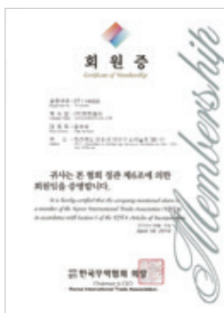
Membership of Korea International Trade Association (KITA)