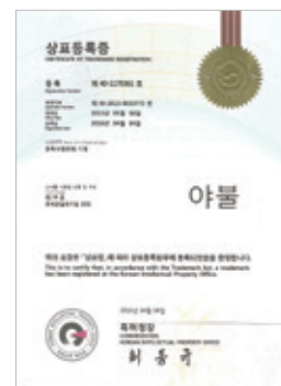
Certificate of trademark registration for brand Yabul