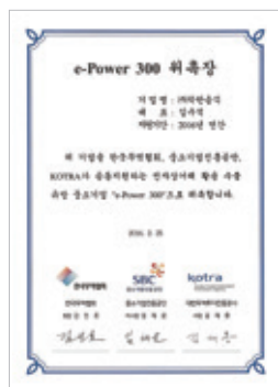
E-power 300 Commission