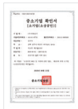
Certified Small & Medium Company