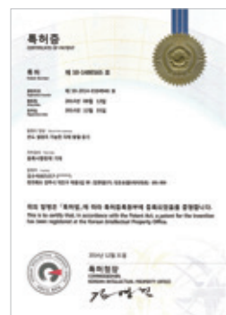
Patent registration on self-heating containers that can control temperatures