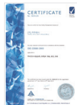
ISO 22000:2005 Certificate